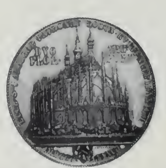
Lot No. 2627

2 Gulden, or Florins, 1887. Commemorates the reopening of the Kuttenberg Silver Mines. Obv. Older laureate head. Rv. Cathedral. Dav.33. Only 400 pieces struck. Proof. Lightly cleaned, now toning. Very rare. (3,500–4,000)